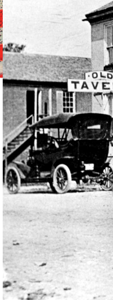
The Old Tavern, Arrow Rock, c. 1912