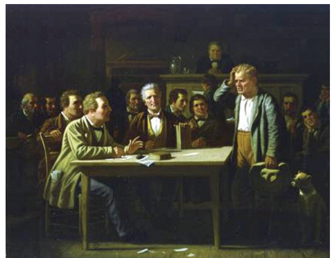
| The Puzzled Witness by George Caleb Bingham