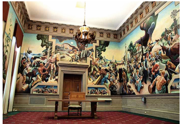
Thomas Hart Benton's mural, The Social History of Missouri, at the State Capitol. The Civil War is depicted in the smoke of the far right.