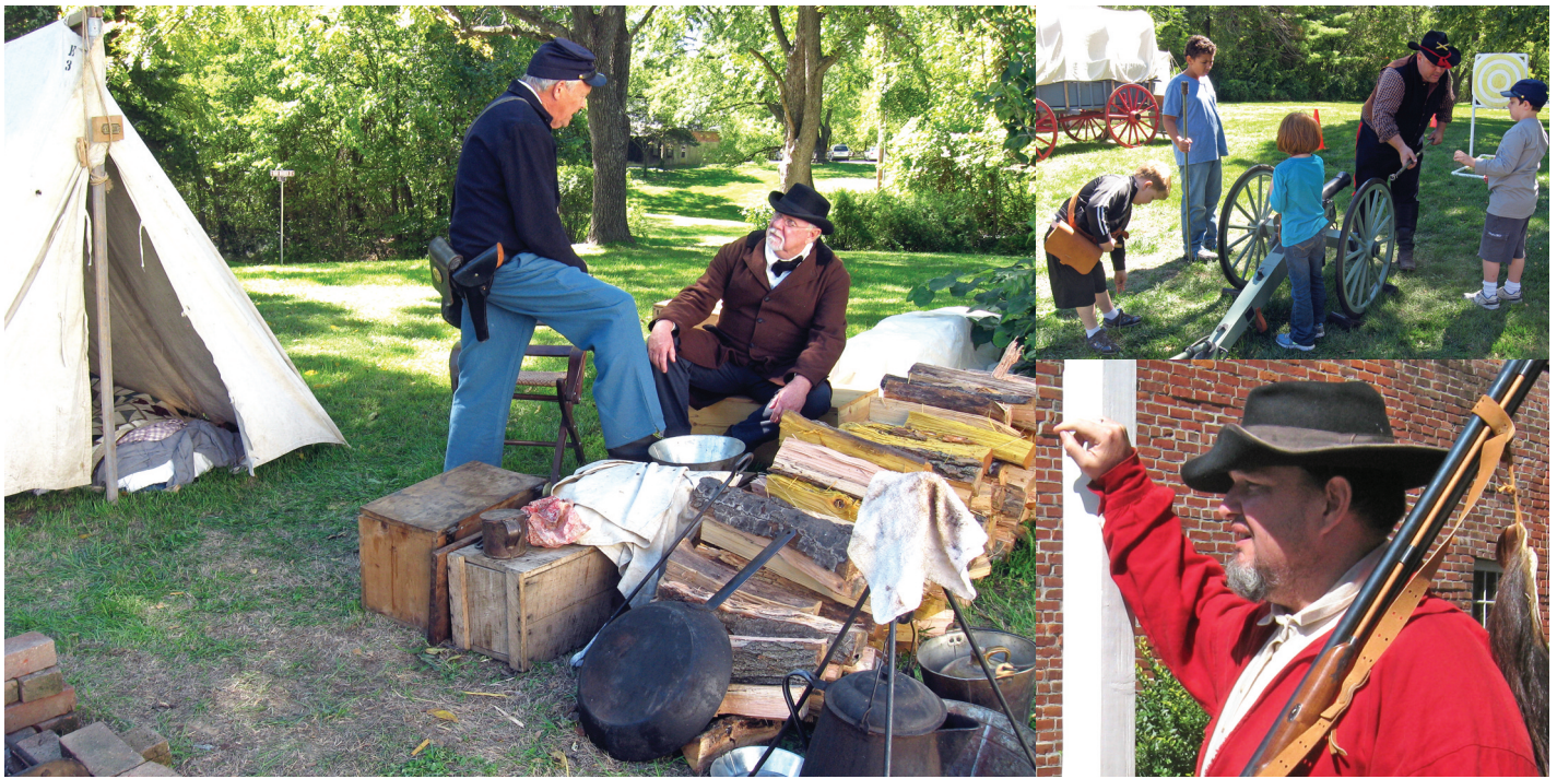
Reenactors from the Holmes Brigade and the 10th Missouri Infantry, Company E set up camps portraying Union soldiers and Bushwhackers during the Sept. 22 Civil War Encampment. Children learned the steps needed to load and fire an air cannon that was provided by the Missouri State Museum.