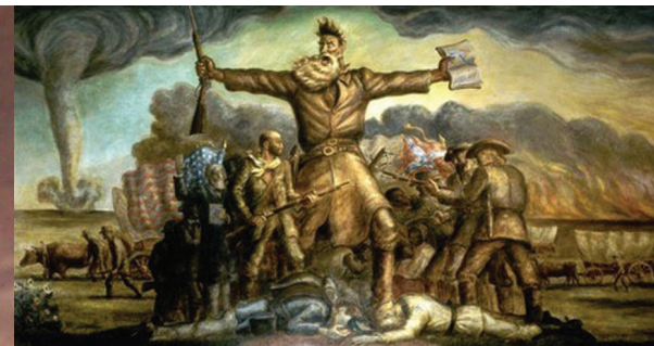
John Stewart Curry's mural of John Brown in the Kansas State Capitol, above