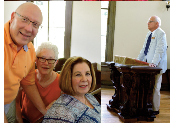
F riends of Arrow Rock members gathered at the historic Christian Church on June 5 for the organization's 57th annual meeting.

CHECK OUT our Web page at FriendsofArrowRock.org and "like" us on Facebook.