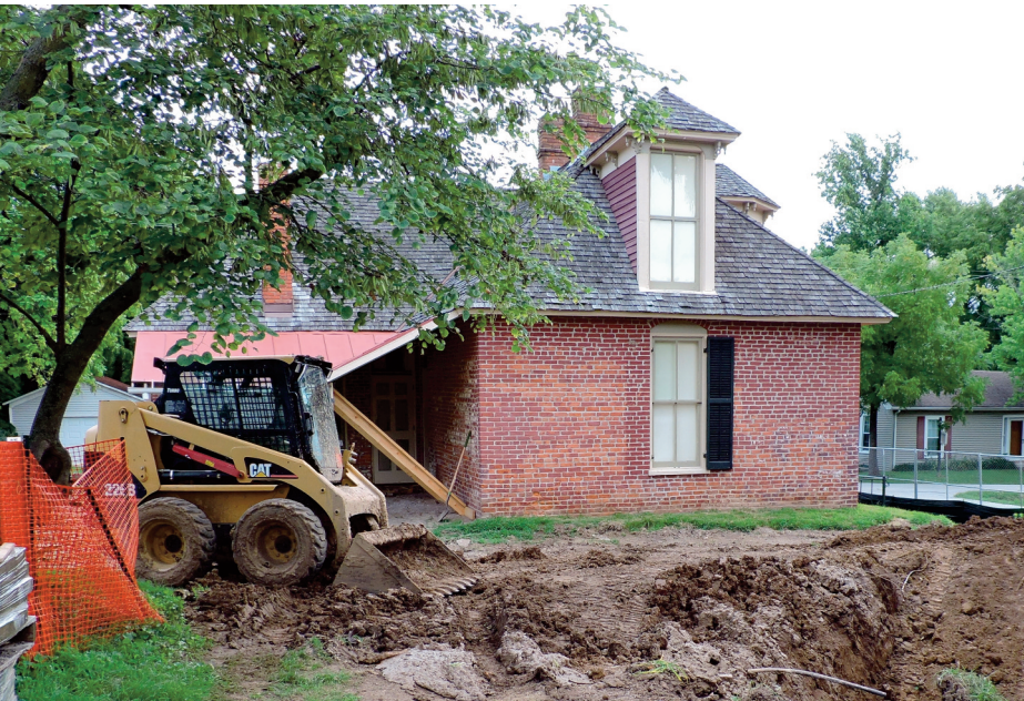
ABOVE: The crew dug out a cellar that had been loosely filled more than 50 years ago, but that was still holding water. LEFT: The ground around the Sites House is being regraded to better divert water from the building. BELOW: Marty Selby (center) visits with the project team following the groundbreaking ceremony.