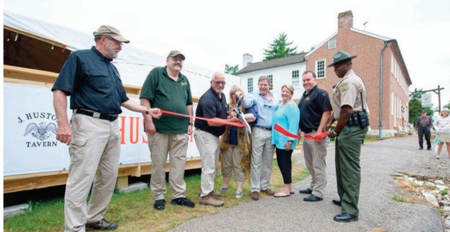
Representatives from the Missouri State Parks and Friends of Arrow Rock gather for a ribbon-cutting ceremony on June 14 to mark the opening of the J. Huston Tavern Summer Kitchen, an expansive outdoor dining room that allows us to continue operating until the interior of the Tavern building is cleaned.