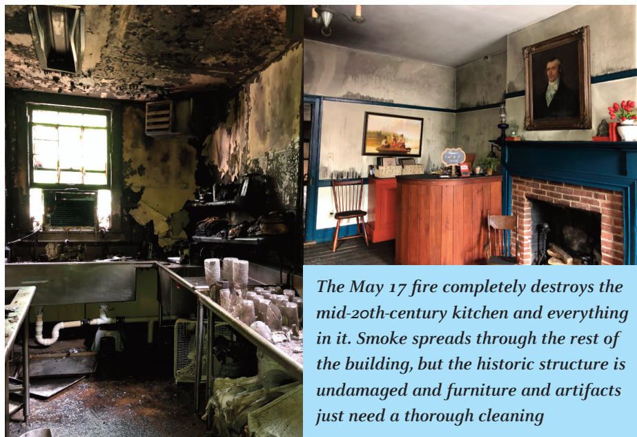
The May 17 fire completely destroys the mid-20th-century kitchen and everything in it. Smoke spreads through the rest of the building, but the historic structure is undamaged and furniture and artifacts just need a thorough cleaning

We created an emblem for the Tavern T-shirts that commemorates the May 17 fire. It proclaims that the J. Huston Tavern has been "Standing Strong since 1834." We feel so fortunate when we say that the J. Huston Tavern is still the oldest continuously operating restaurant west of the Mississippi. AR