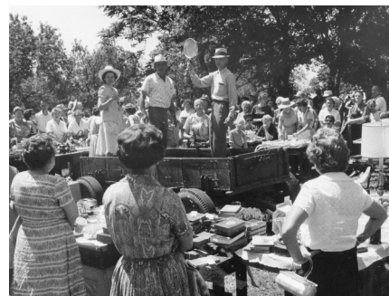
Above, the 1961 Arrow Rock Country Auction draws a crowd.