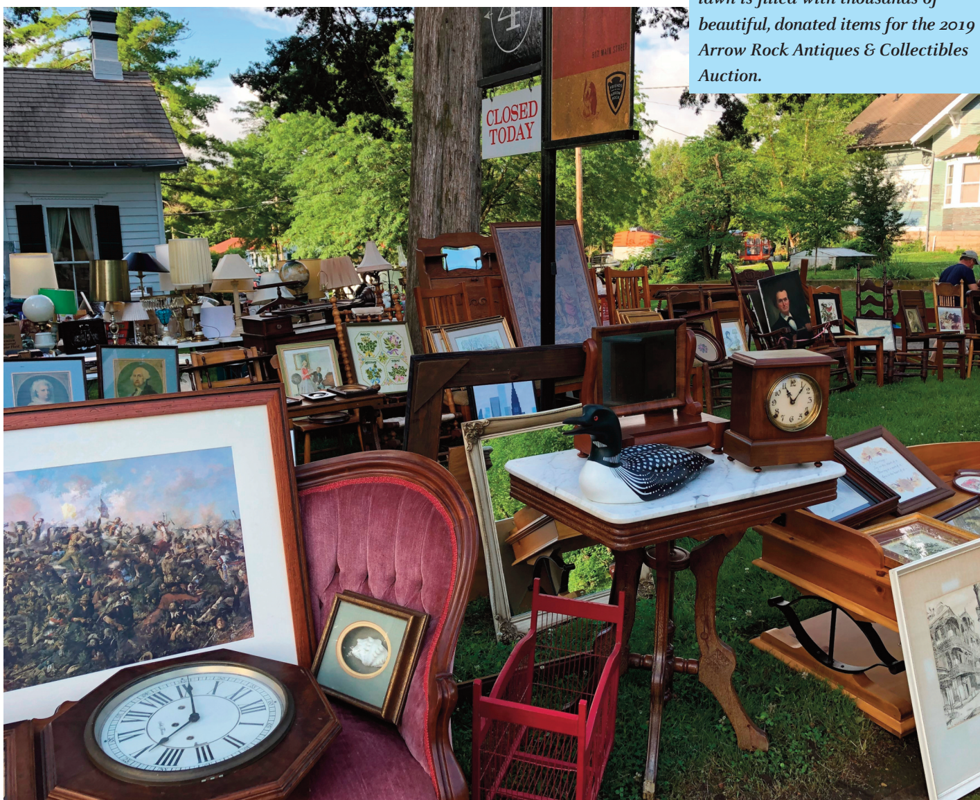
Below, the Miller-Bradford House lawn is filled with thousands of beautiful, donated items for the 2019 Arrow Rock Antiques & Collectibles Auction.